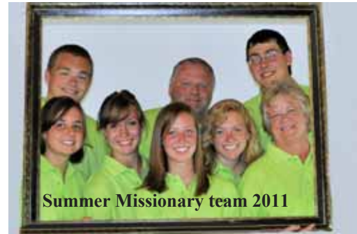
Summer Missionary team 2011

THE YEAR WAS BLESSED! God worked in MANY hearts of boys and girls; 62 names were added to the Lambs Book of Life, 102 children rededicated their lives to Christ and 15 indicated they sensed God was calling them into fulltime Christian service, Praise the Lord! THIS is the reason we faithfully serve at camp. There could be no other reason we'd even think of doing this job!! Thank you for partnering with us to provide this wonderful opportunity to children!